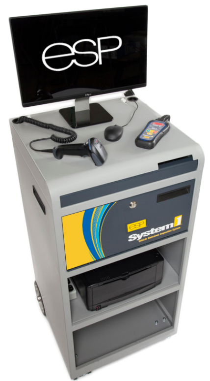
Cabinet OBD System

We're always just a phone call or click away. ESP provides complete solutions so that you can have complete peace of mind.